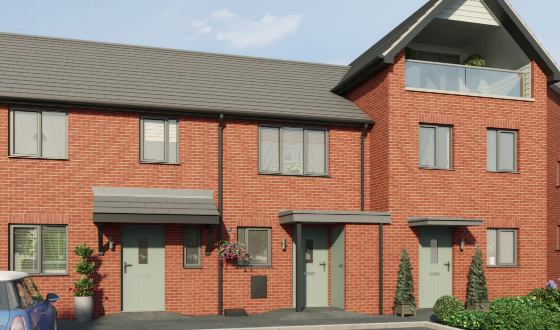
Bowmont 2 Bedroom House (633 sq.ft)