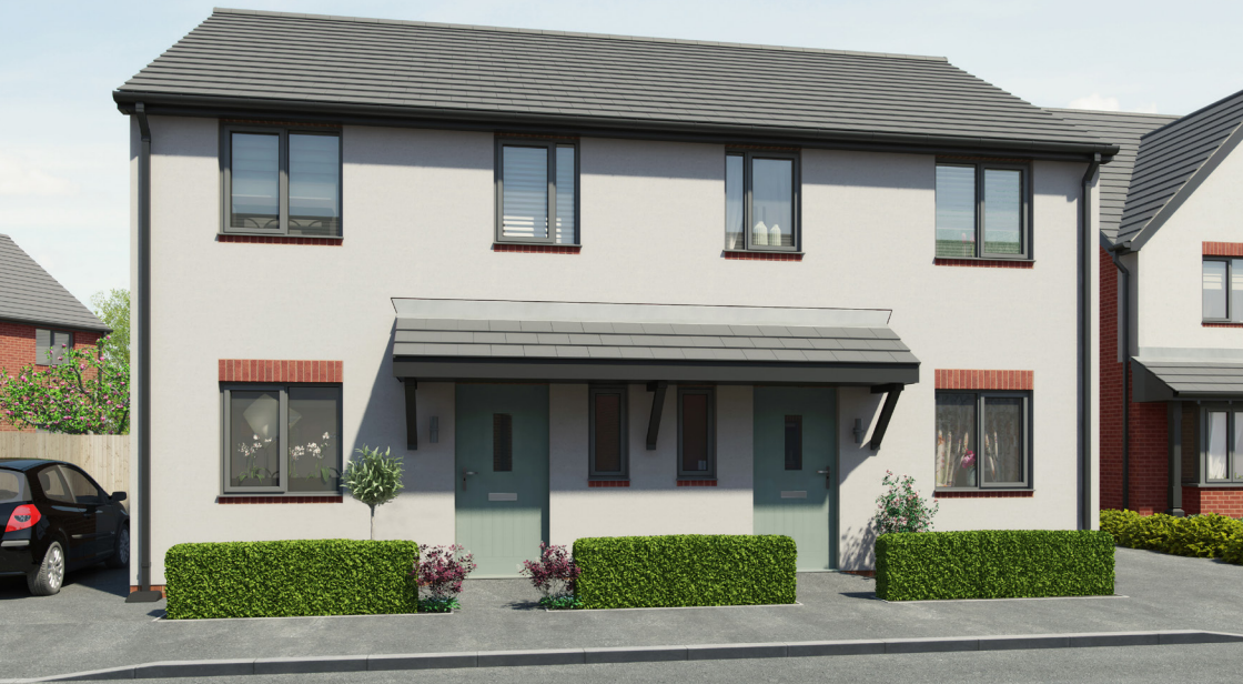
Ribble 3 Bedroom House (816 sq.ft)