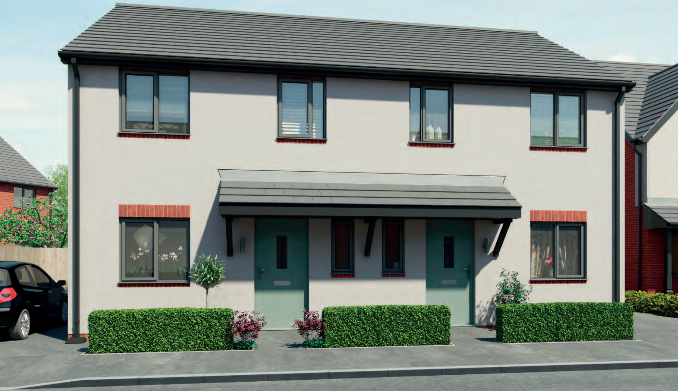
Darwin 2 Bedroom House (816 sq.ft)